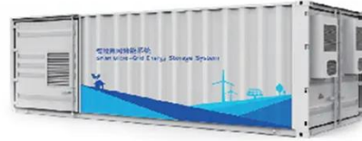
Parallel (Parallel operation up to 6 unit (only with battery connected))

If you're exploring photovoltaic (PV) solar panel options for residential, commercial, or industrial projects, understanding the latest standards for photovoltaic solar panels is crucial. Let's break down what's ...