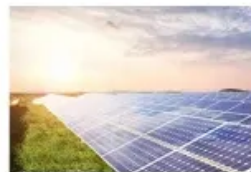
Energy Storage System