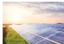
Energy Storage System